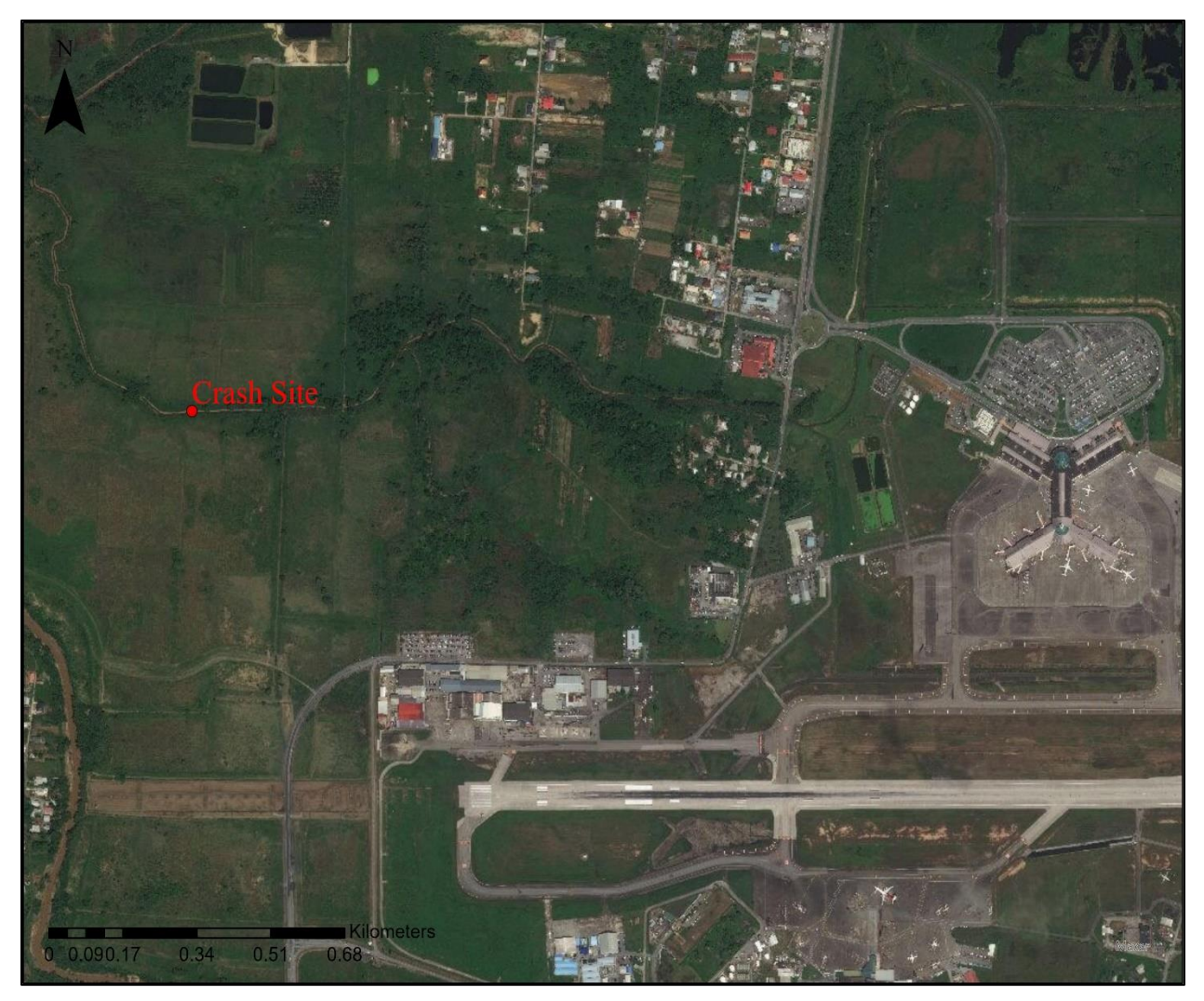
Figure 2: Map showing the Crash Site.