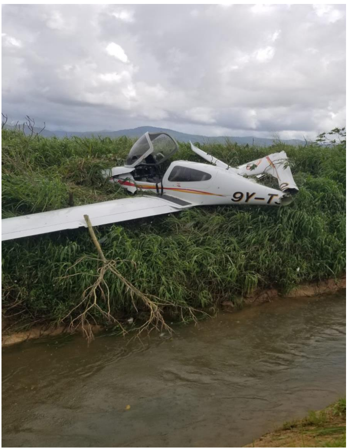
Figure 3: An image of the crashed aircraft, 9Y-TJU.

• The hull of the aircraft sustained significant damage including but not limited to main undercarriage dislocation, nose gear broken off at attachment points and almost complete separation of the tail from the aircraft. (See Figure3.)