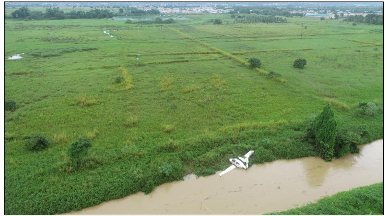
Figure 1: Crashed aircraft on the bank of the Oropune RIver.